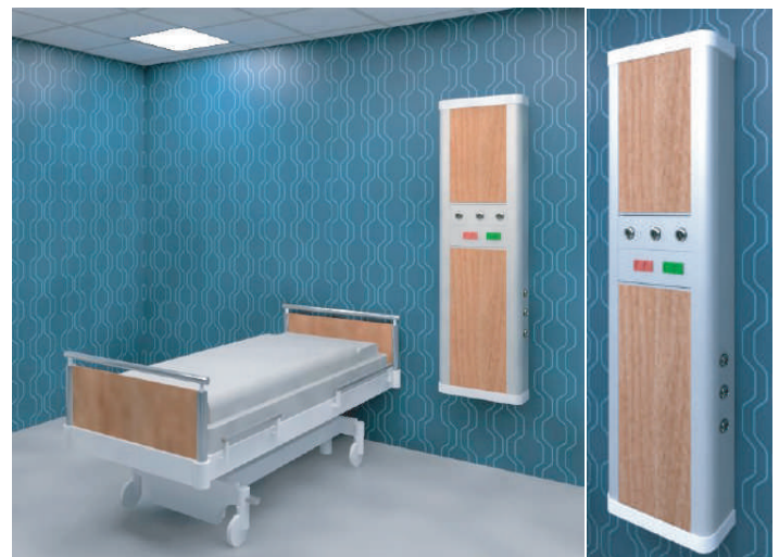
VIP BHU WITH ICU BHU MIXED DESIGN