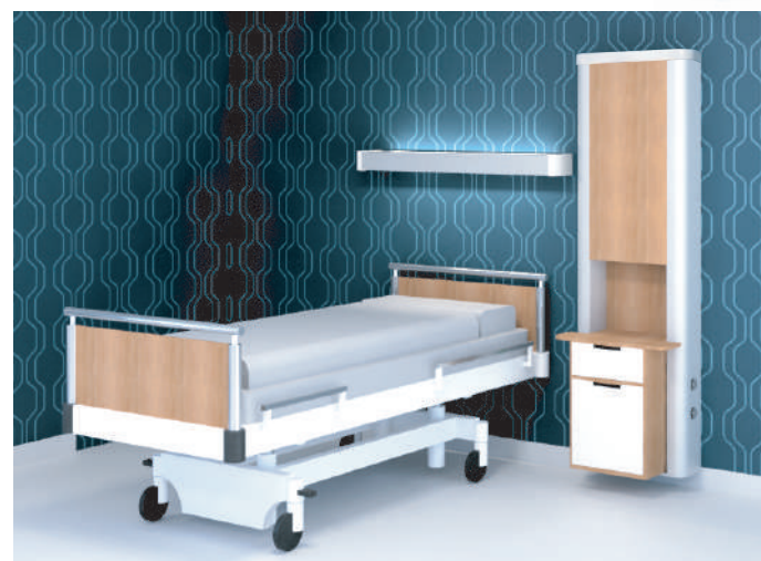
VIP BHU WITH BEDSIDE CABINET DESIGN