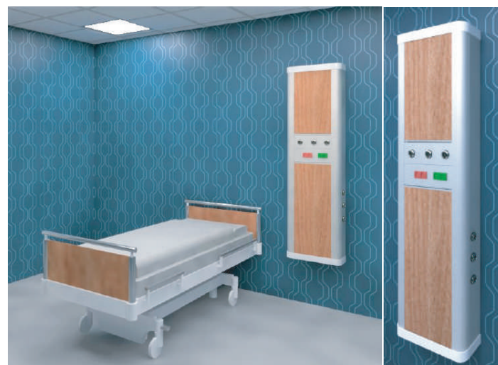
VIP BHU WITH ICU BHU MIXED DESIGN